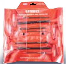
METRIC T-HANDLE BALL DRIVER SET(7-PCE) KEN6027770K