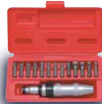
15-PCE IMPACT DRIVER SET 1/2" SQ. DR. KEN5737100K