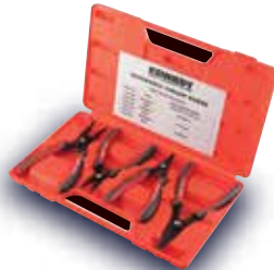
10-65mm SPRUNG CIRCLIP PLIER SET(4-PCE) KEN5586090K